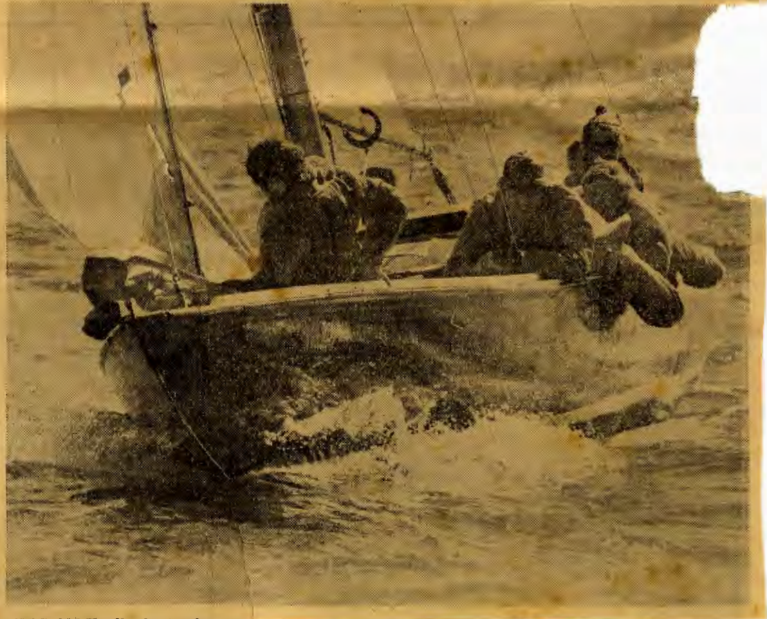
IT'S NOT all plain sailing in the Lipton Cup. The crew on Sunmaid hang over the side of their yacht getting drenched as they battle to bring it to an even keel while beating into the wind during yesterday's racing. In spite of the hard work, Sunmaid came in seventh.