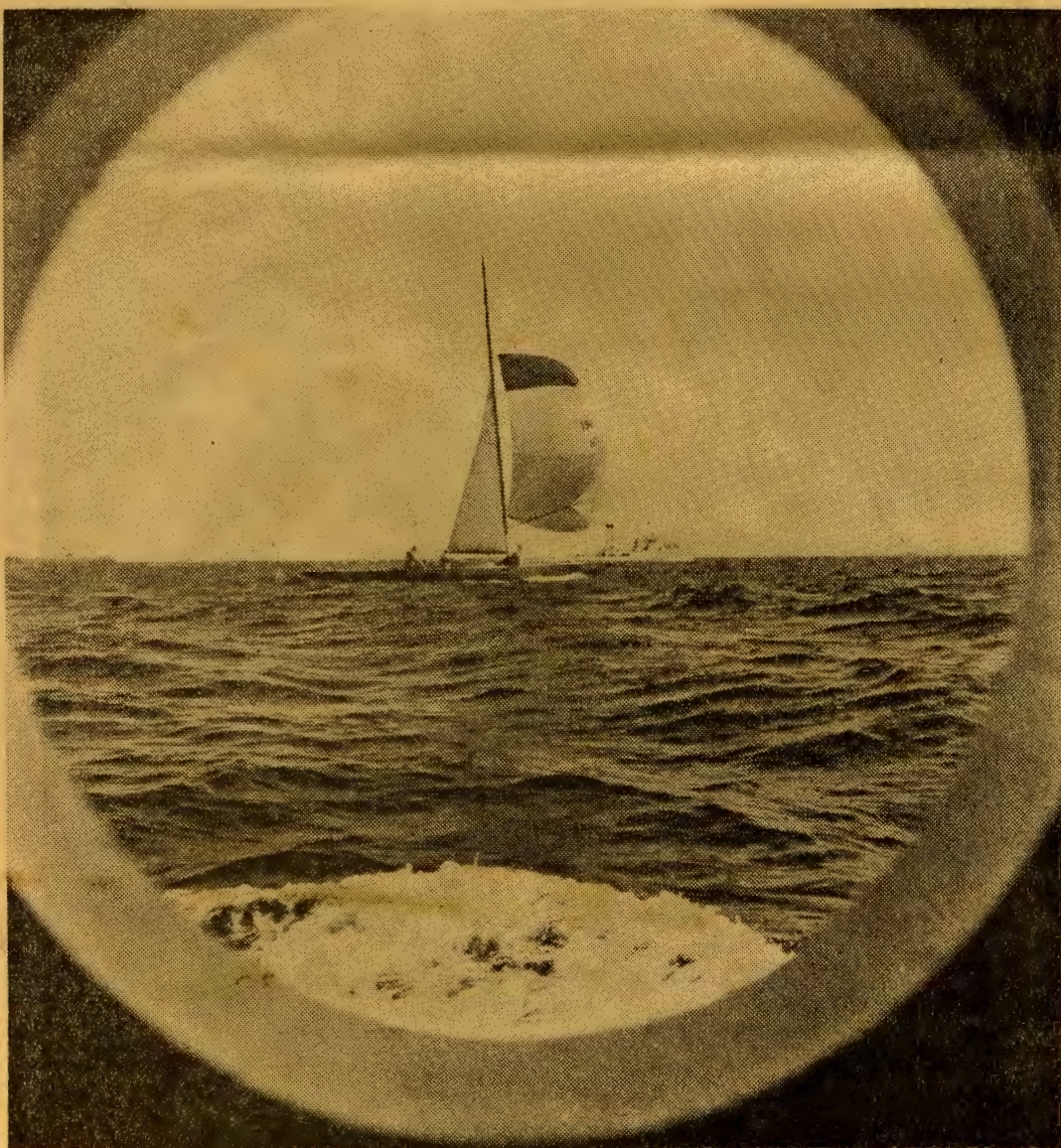
THIS PORTHOLE VIEW shows Sunrose — the most successful yacht so far in the Lipton Cup — making about eight knots under spinnaker as she flies down-wind to complete the first lap of the Olympic standard size course during yesterday's racing.