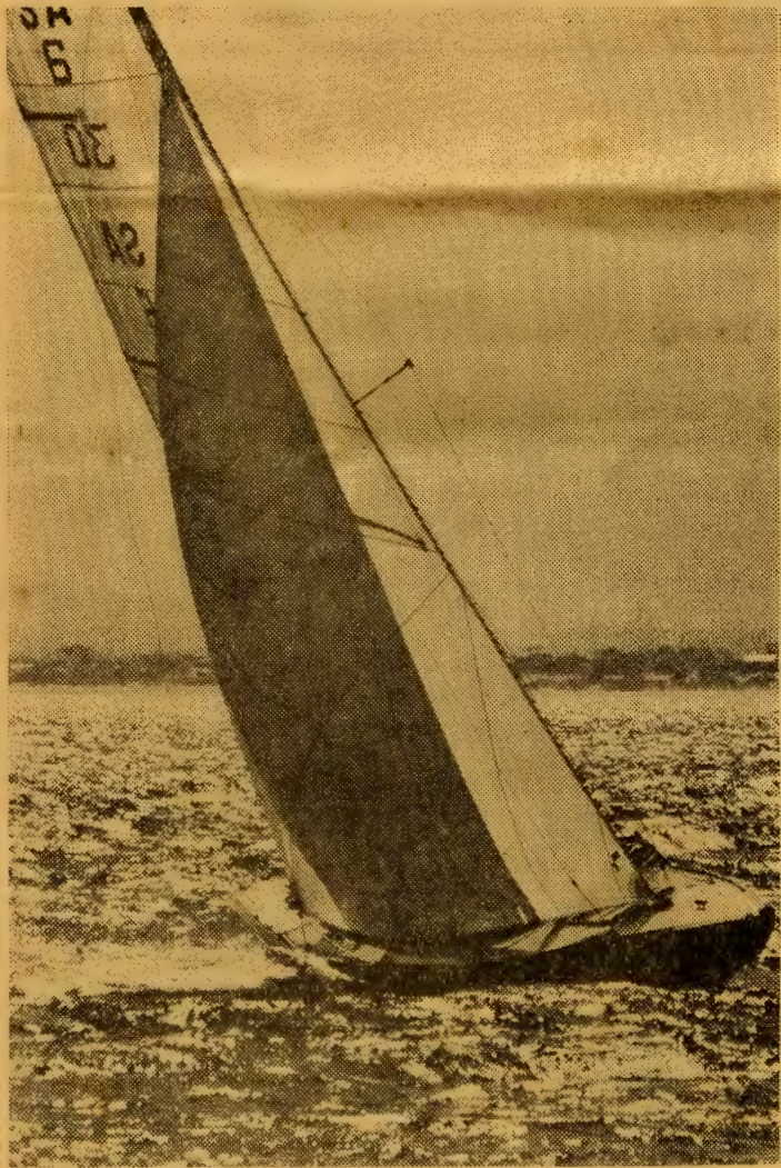
CUTTING ALONG to the windward buoy in yesterday's race on Table Bay, the Royal Cape Yacht Club's entry Yvette shows the style that took her into third place.