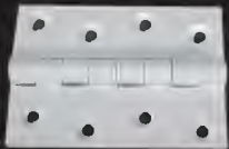
NYLON DOOR HINGES 97x70mm open